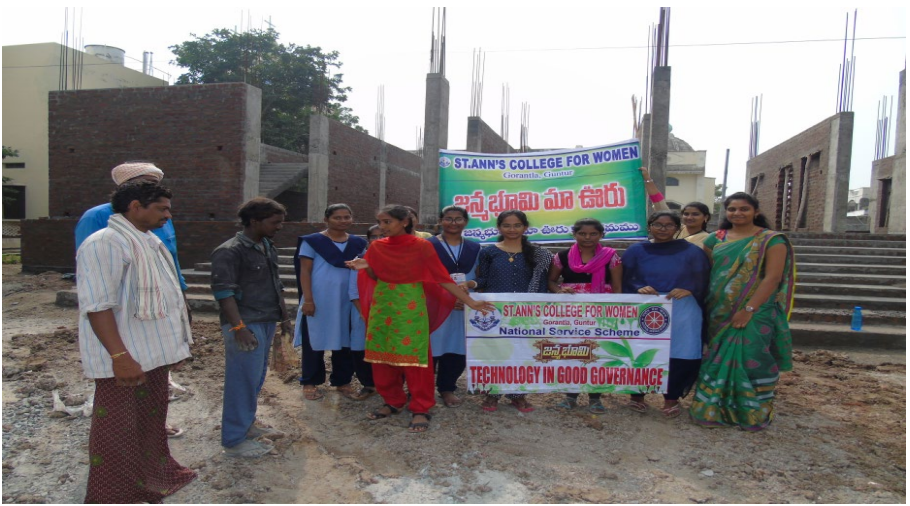
NSS Volunteers Participated Technology in Good governence