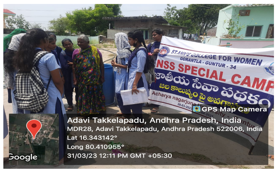
NSS volunteers participated in awareness program on water pollution