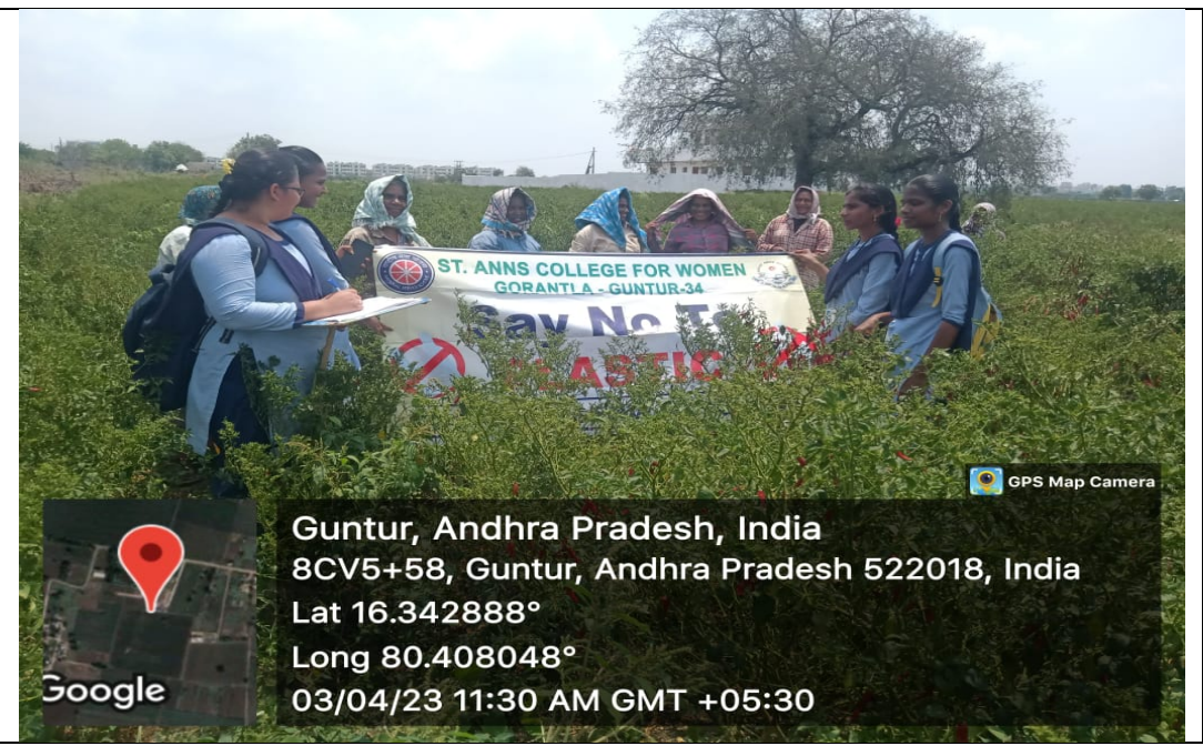
NSS volunteers participated in awareness program on Plastic Ban